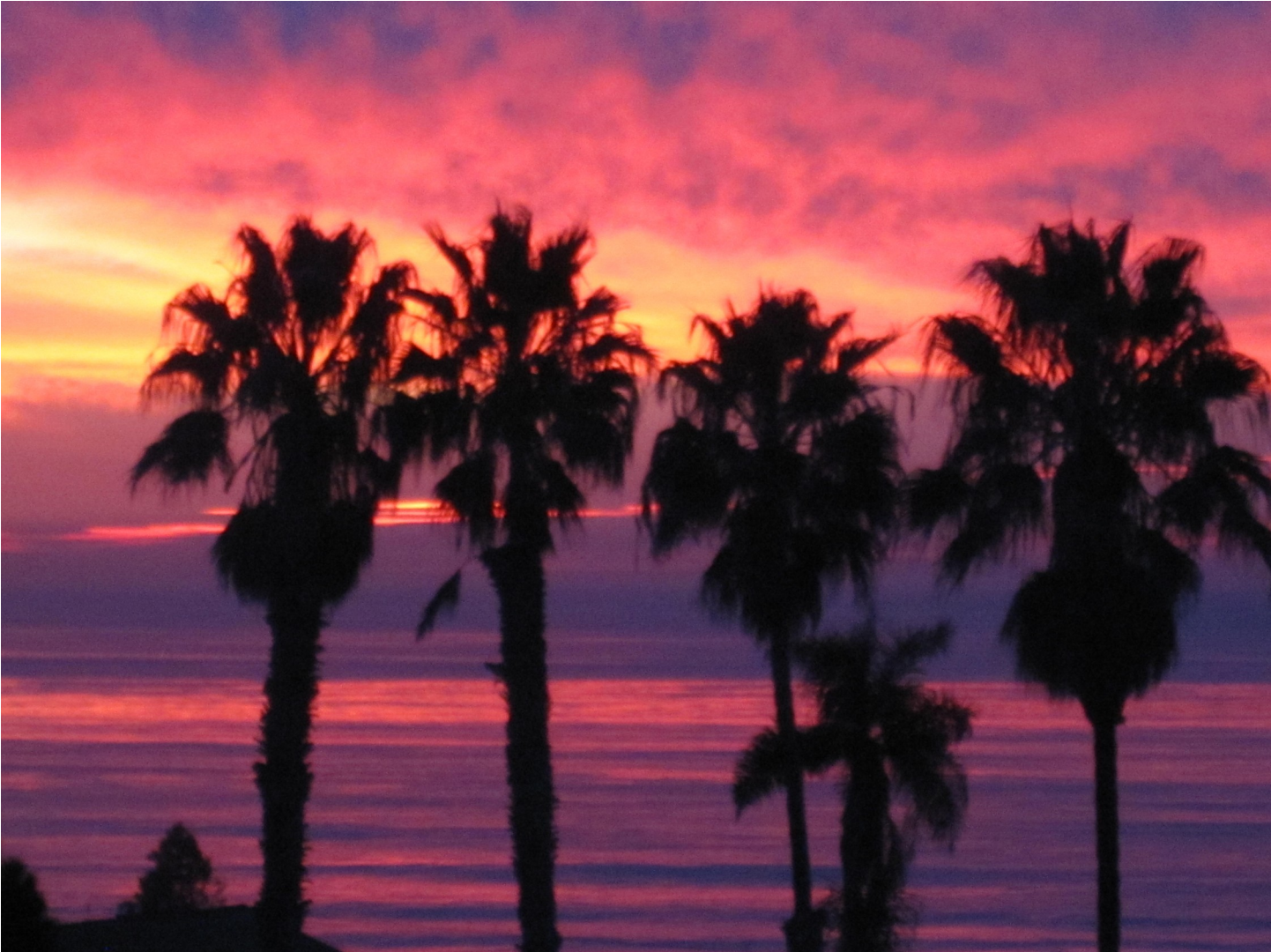
Sunset Cliffs, Saturday, January 10, 2010